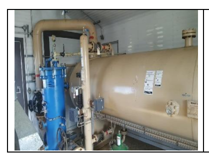
AMiCS #: 31437117

31440403 36" x 16' Vertical 125 Psi Housed in Knockdown Building